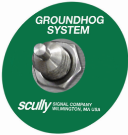
Scully Ground Bolt