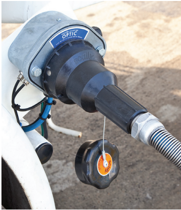
One Connection for Overfill Prevention and Earthing