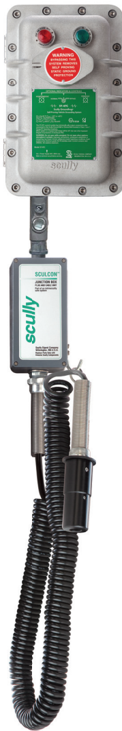
Scully Groundhog Control Monitor with Plug and Cable