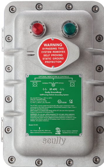
Groundhog Earthing Verification System

The Scully Groundhog earthing system can be used for a wide variety of loading applications for use with tank trucks, rail cars, and aircraft refuelers.