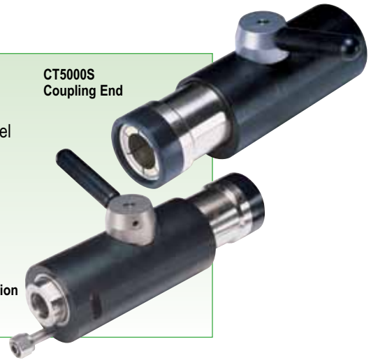
CT5000S Coupling End