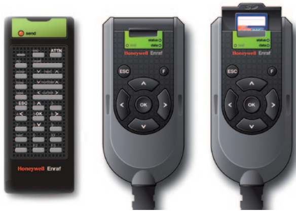
Part Number: 10-31052-F4